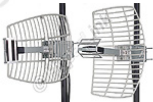
Vertical or Horizontal Polarization

The HG2415G antenna is supplied with a 60 degree tilt and swivel mast mount kit. This allows installation at various degrees of incline for easy alignment. It can be adjusted up or down from 0° to 60°.