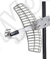
Tilt & Swivel Mast Mount